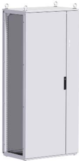
HFMD - 1DR