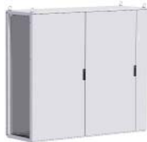
HFMDT - 2DR