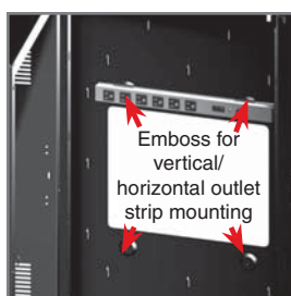
Mounting points for easy mounting of outlet strip.