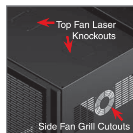
Generous fan knockouts/cutouts for cooling.