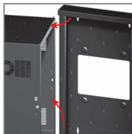
Center section easily removes for installation.