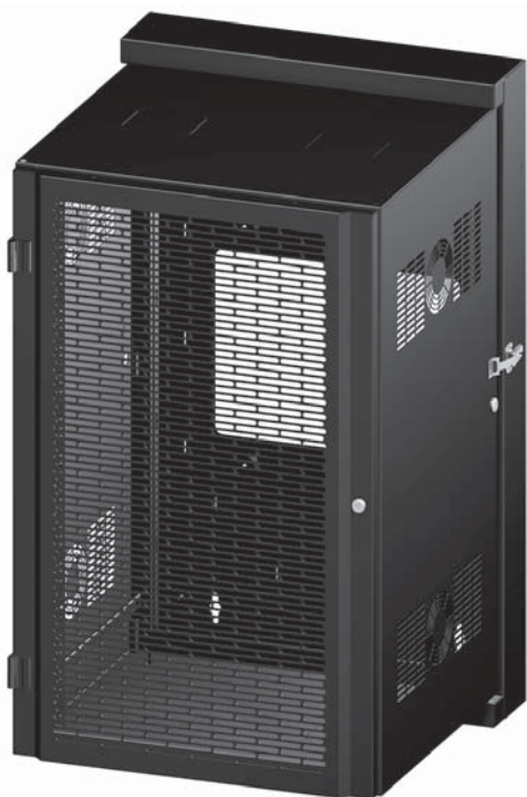
Vented front door included